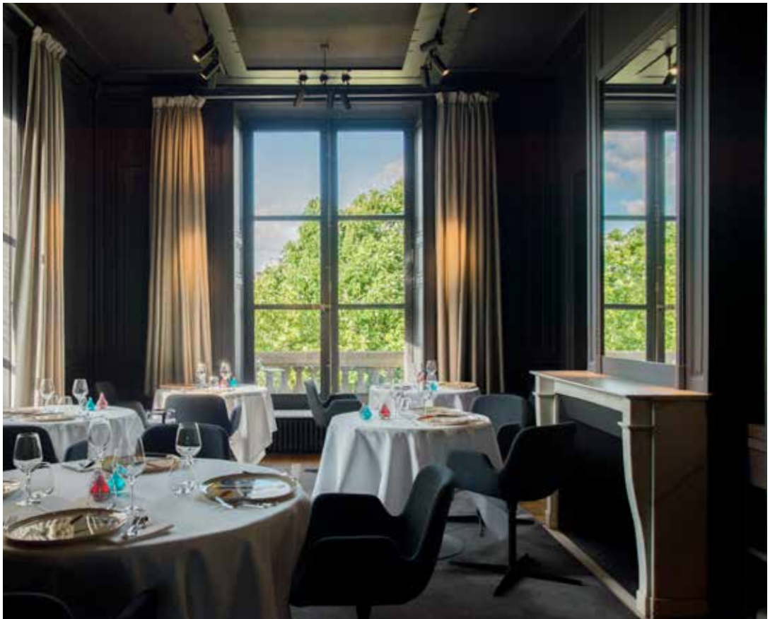
Restaurant Guy Savoy, Monnaie de Paris, lounge Scènes de Paris