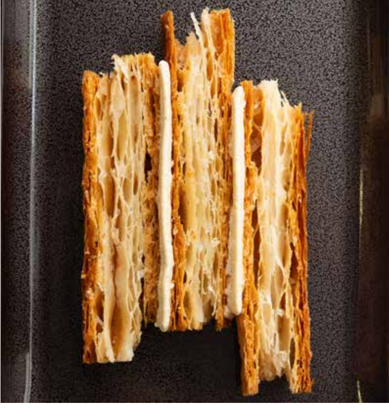
'Open' mille-feuille with Tahitian Vanilla