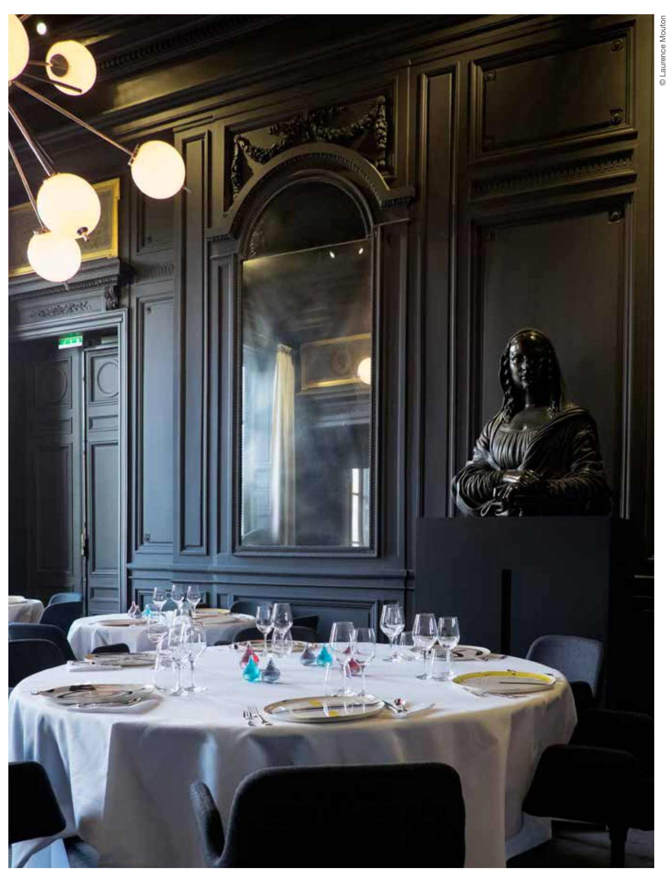
Restaurant Guy Savoy : lounge Belles Bacchantes