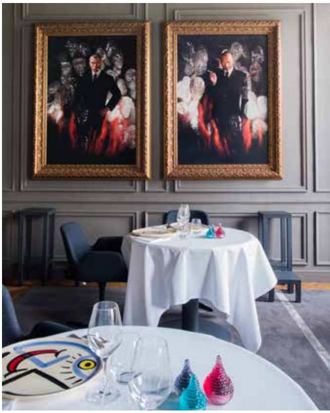
Autoportrait à la cigarette, Pierre et Gilles, 1999