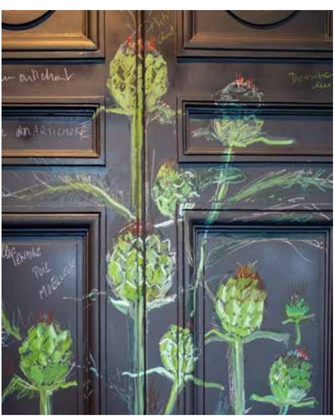
Artichauts (Dessine-moi un artichaut), Fabrice Hyber, 2018