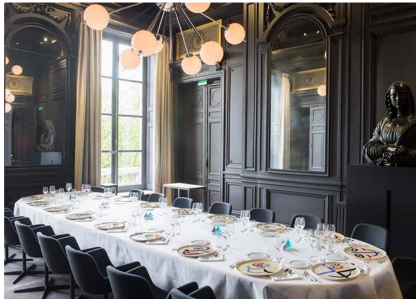
Restaurant Guy Savoy, lounge Belles Bacchantes

The harmony of a table can only be born with the complicity of those who toil behind the scenes. Guy Savoy and his teams work side by side with artists and designers to conceive and produce each object present on the restaurant's tables. It is this harmony between the objects themselves and the people engaging with them that suffuses the dining rooms with their uniquely peaceful ambience.