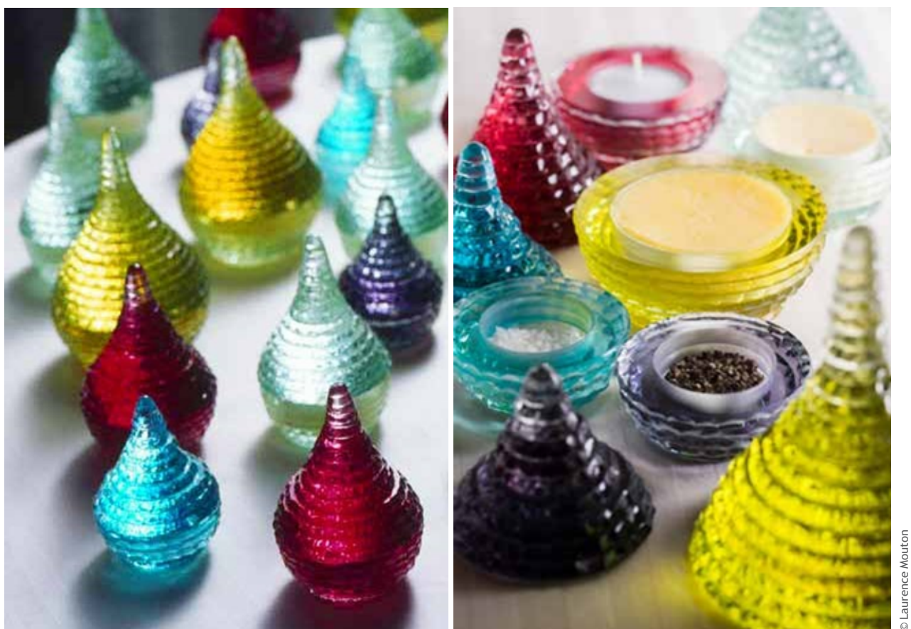
Water droplets by Layrent Beyne for Guy Savoy