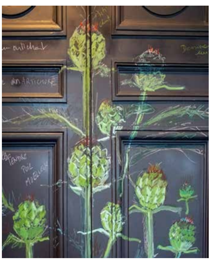
Artichauts (Dessine-moi un artichaut), Fabrice Hyber, 2018