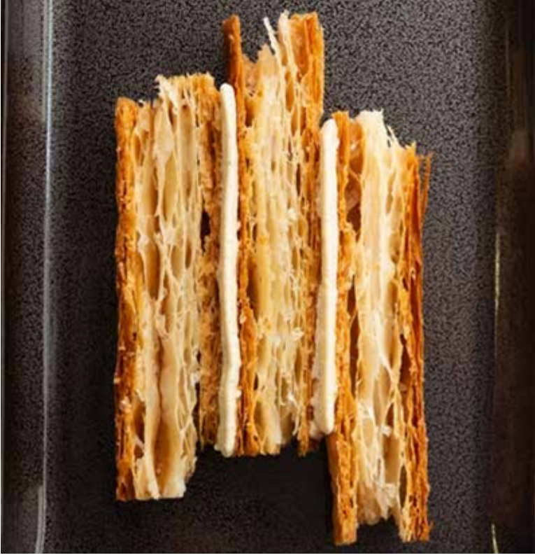
'Open' mille-feuille with Tahitian Vanilla