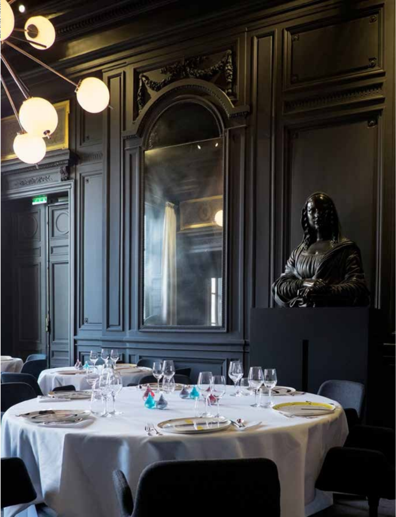
Restaurant Guy Savoy: lounge Belles Bacchantes