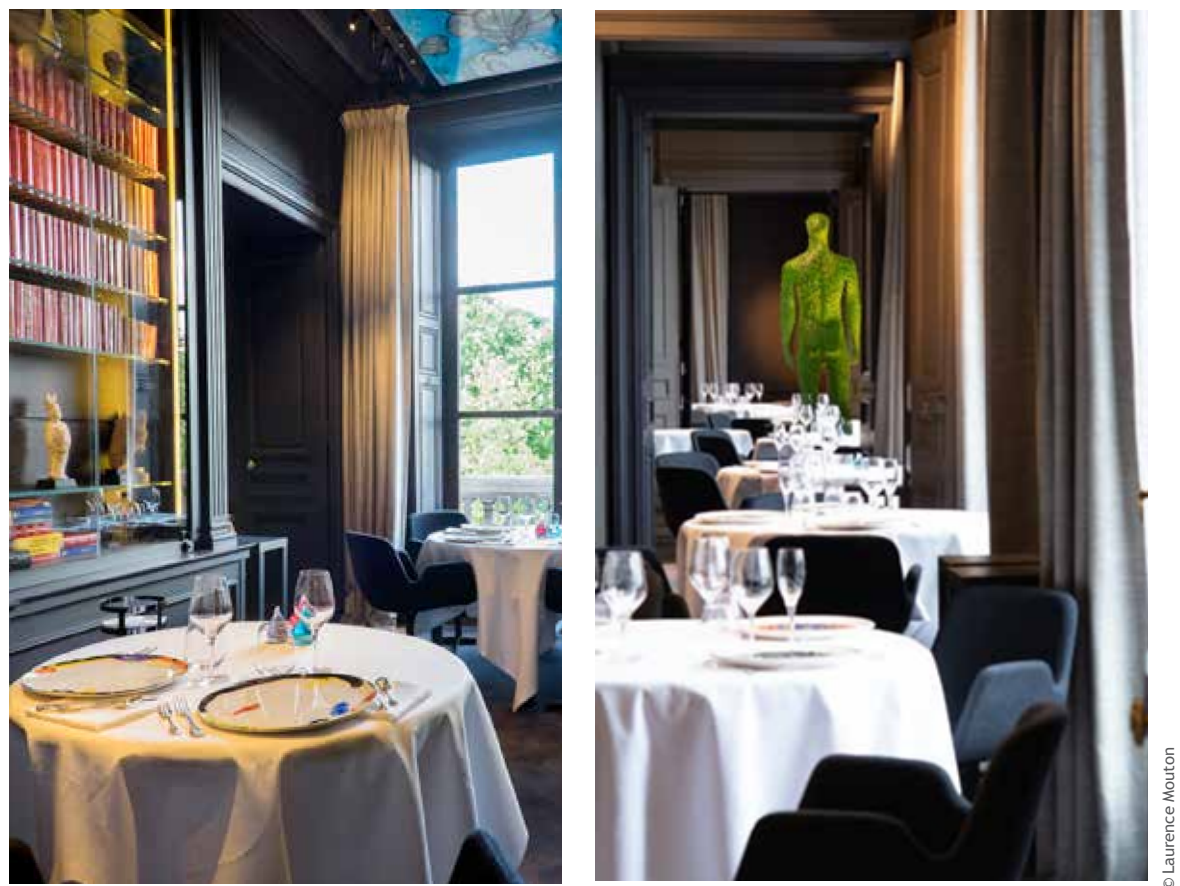
Restaurant Guy Savoy library