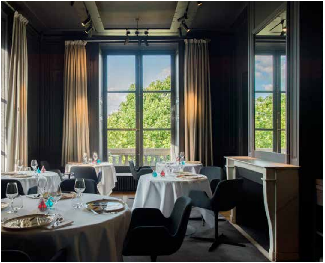
Restaurant Guy Savoy, Monnaie de Paris, lounge Scènes de Paris