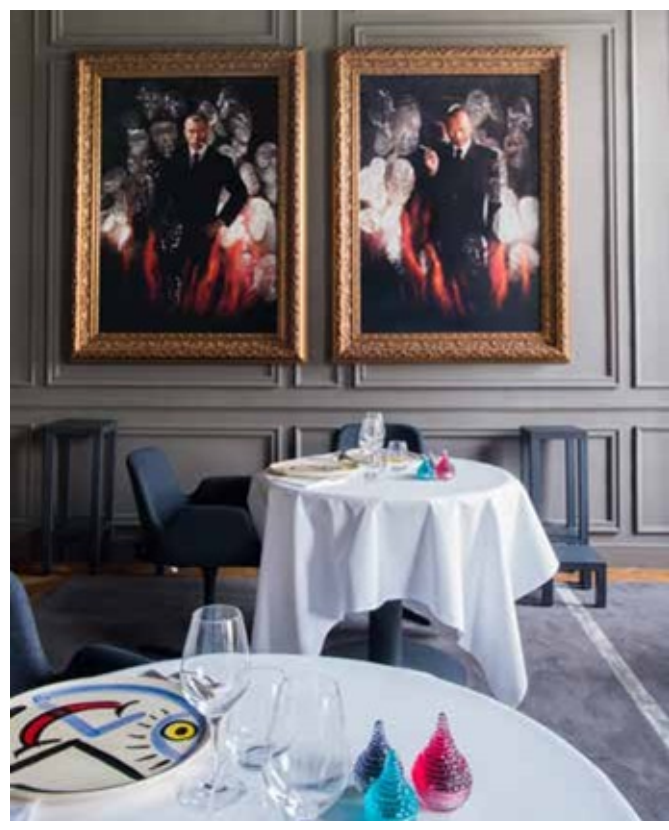
Autoportrait à la cigarette, Pierre et Gilles, 1999