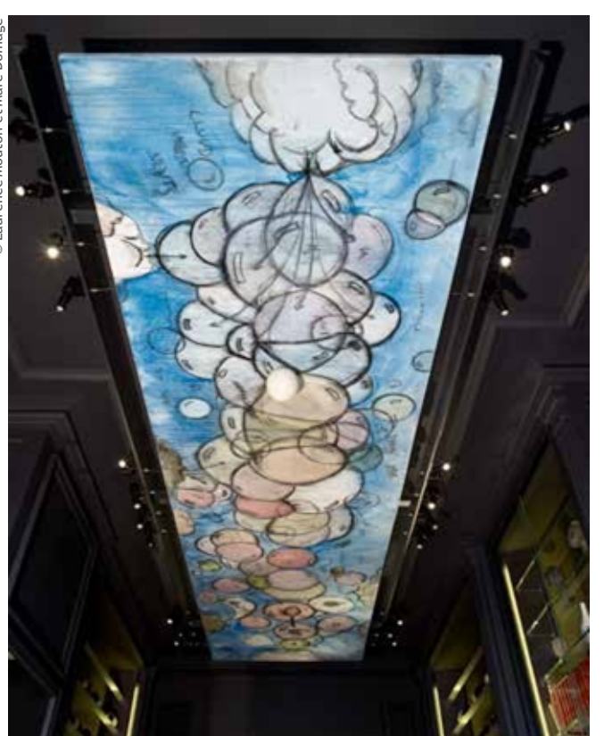
Effervescence, Fabrice Hyber, 2015